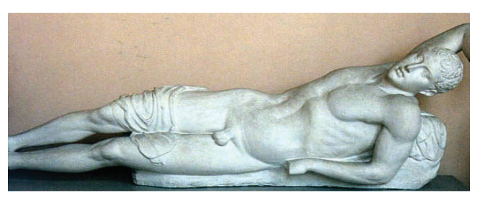
Niobid - - 4th Cent. BCE

What is the case and reason? Clue: hosti is the same and depends on misera <u>nd</u>a.